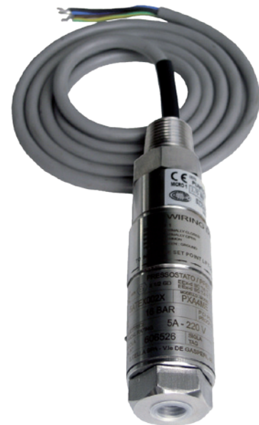
Mini pressure switch model PXS