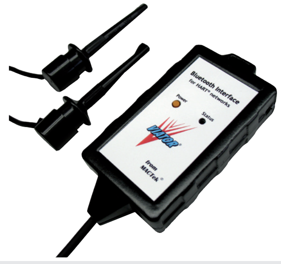
Bluetooth Ex ia HART® Interface with two test clips