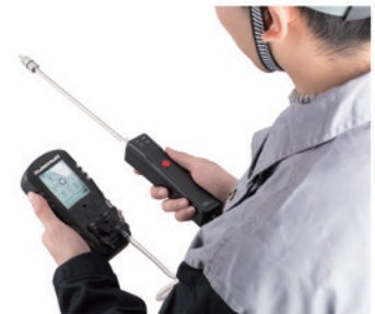
external pump gas detector