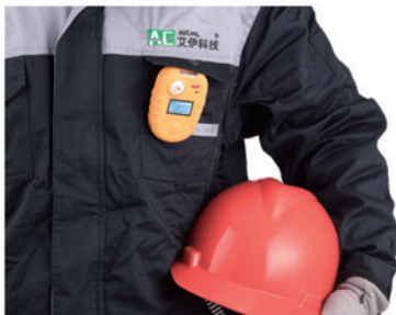
difussion type gas detector

The portable gas detector is small in size and easy to carry. It can be used for workshop routing inspection for side leakage, as well as in confined spaces such as flame operation inspection.