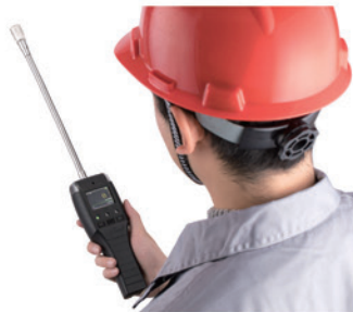
build-in pump gas detector