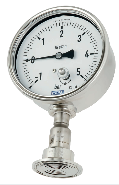
Diaphragm seal system, model DSS22P