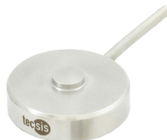
Compression force transducer, model F1226