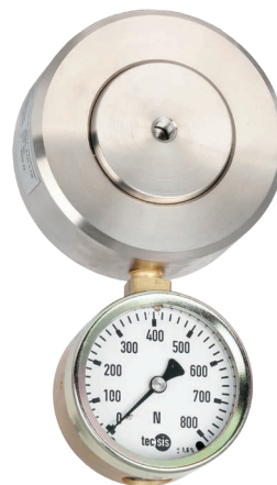
Hydraulic compression force transducer, model F1115