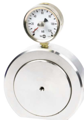
Hydraulic compression force transducer, model F1136