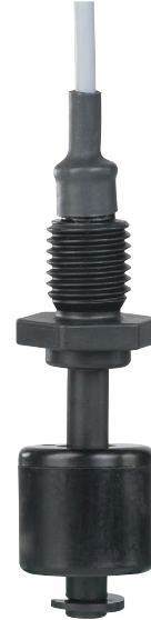
Float switch, model RLS-7000